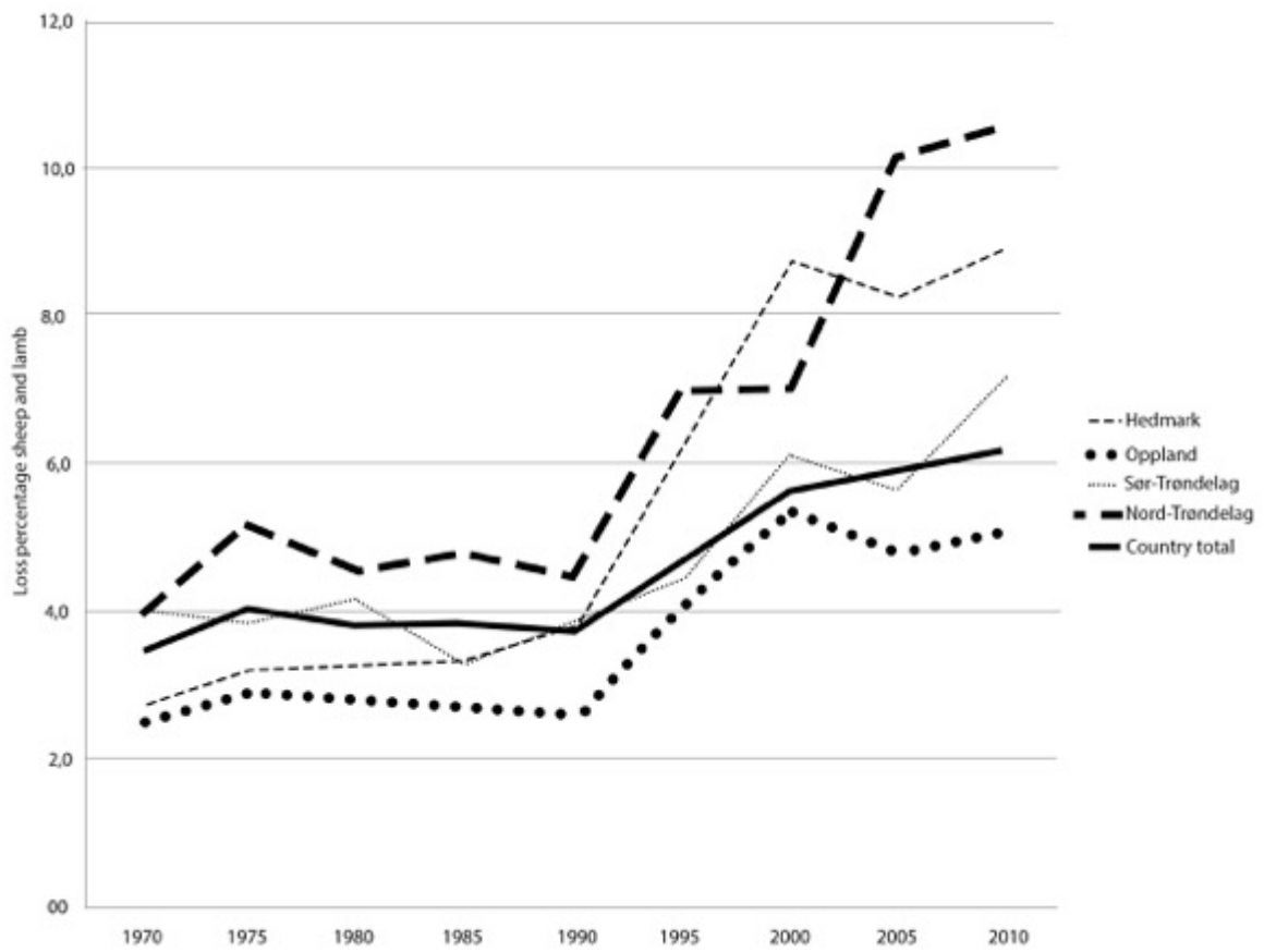
Figure 2. Sheep loss in Norwegian counties with high carnivore prevalence 1990 – 2010. In % of summer grazing population